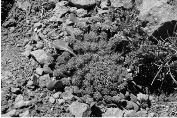
Fig. 1 Nastanthus spathulatus .

ovule ratio is 868 (Table 1). Maturity of the inflorescences is centrifugal, and the anthesis of individual flowers within inflorescences has no specific pattern. Inflorescences take approximately 9 days from the opening of the first flower to the opening of all flowers. Flowers open initially by separation of the tepals and the style bearing the pollen mass takes approximately 4 h to become fully elongated. However, it takes 9 days from the first flower opening for the stigmas to swell to twice their diameter at anthesis. Removal of pollen from the presenter was variable, in some cases it was removed in 2 days, but in other cases it remained for over 9 days. In their general survey of flower visitors, Arroyo et al. (1982) reported ants as visitors to the inflorescences of this species in the central Chilean Andes.