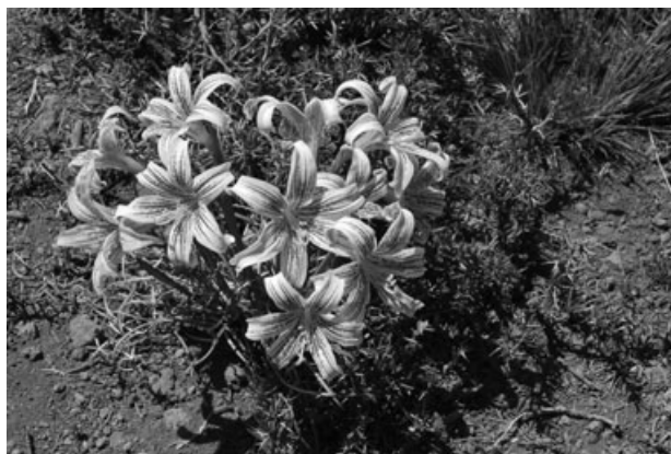
Fig. 2 Rhodophiala rhodolirion .

Mean ± standard error. na, not applicable.